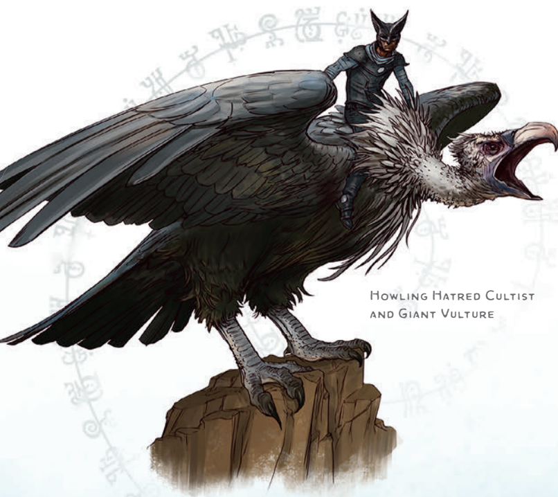
HOWLING HATRED CULTIST AND GIANT VULTURE

The cult fanatics are named Amarath and N'von. They speak for the rest of the group and claim to speak on behalf of Yan-C-Bin as well. Amarath and N'von wish to make contact with a cloud giant and have no interest in dealing with anyone else. If the characters get in the way, the cultists ignore them and call out for master of the tower. If the characters get pushy or turn violent, the cultists attack them.