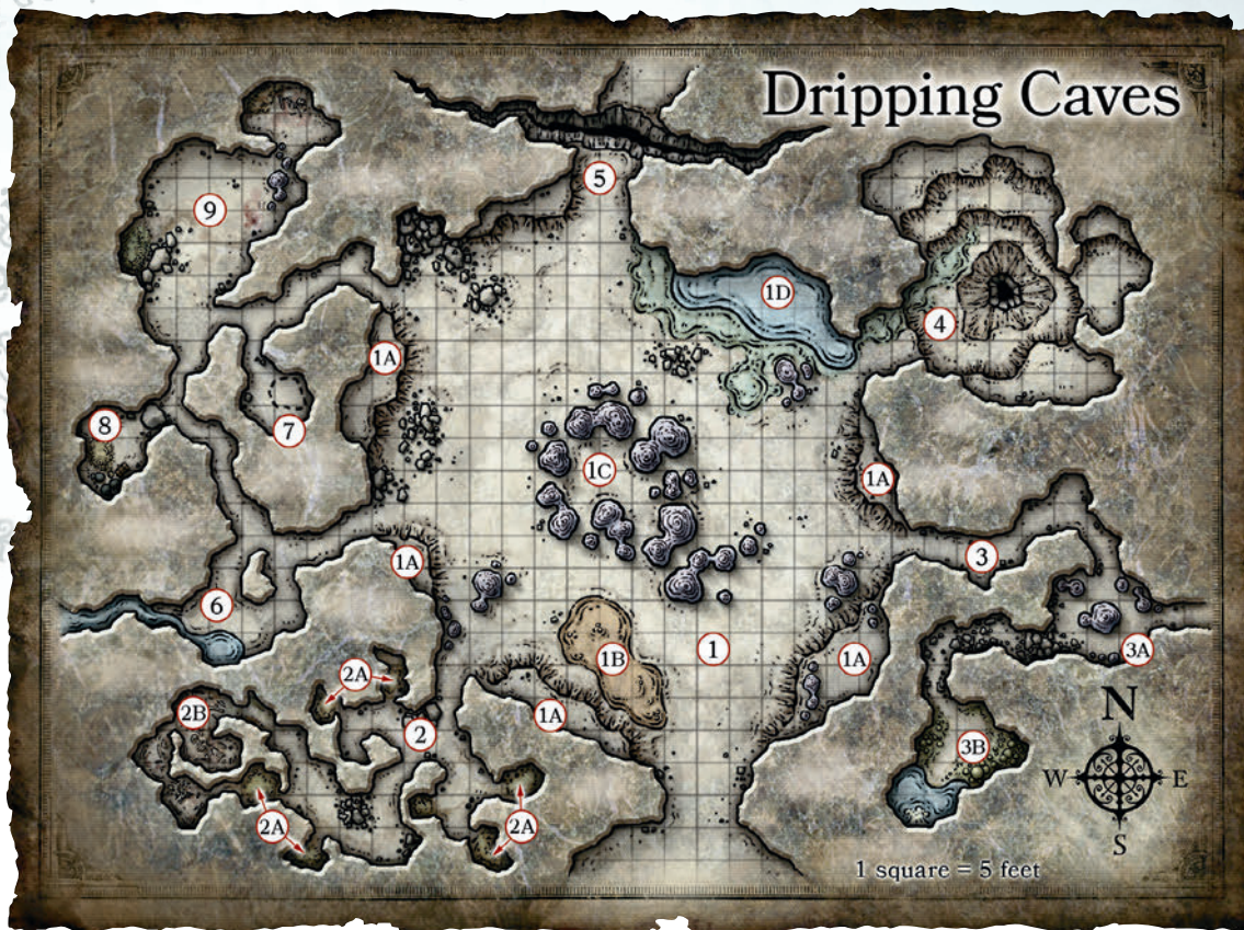
MAP 1.2: DRIPPING CAVES

Hark, the goblin boss, isn't an unreasonable creature. His instincts for self-preservation outweigh any natural animosity he feels toward his enemies or his prey. Characters can negotiate with Hark and avoid unnecessary bloodshed (see area 9), or they can kill Hark and his followers to win the villagers' freedom—the choice is theirs.