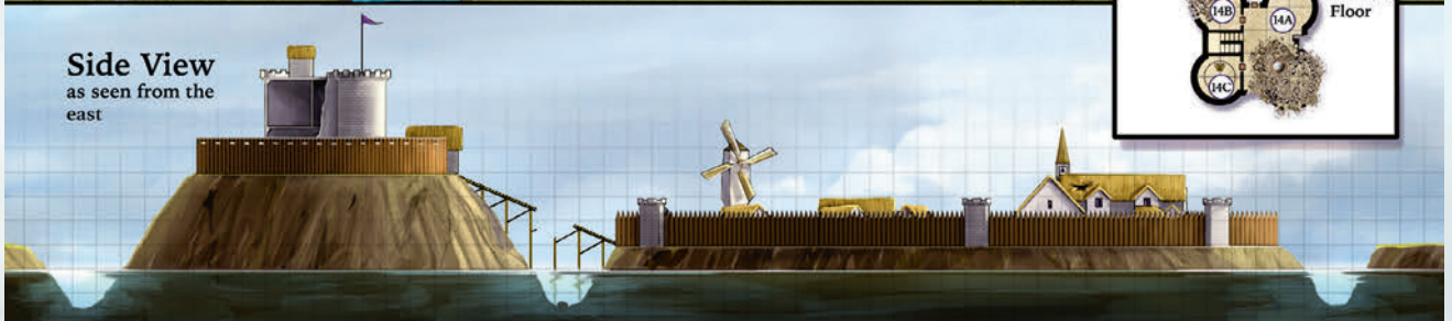
MAP 1.1: NIGHTSTONE